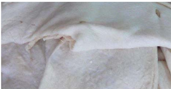
Hydrolyzed Gelatin/Bovine collagen/Hydrolyzed collagen