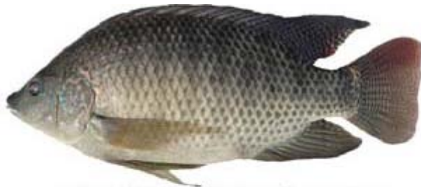
FISH COLLAGEN MADE OF TALAPIA